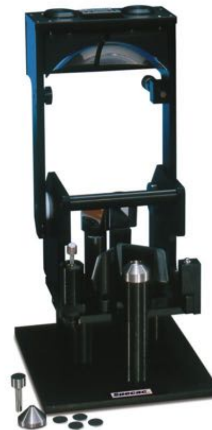
Figure 1: Specac Selector Diffuse Reflectance Accessory

Chrysotile may also be distinguished from the inosilicates by the absence of absorption bands between 950 to 750cm -1 . Crocidolite may be distinguished from amosite by bands at 870, 690, and 580cm -1 and the absence of strong bands at 1000 and 460 cm -1 .